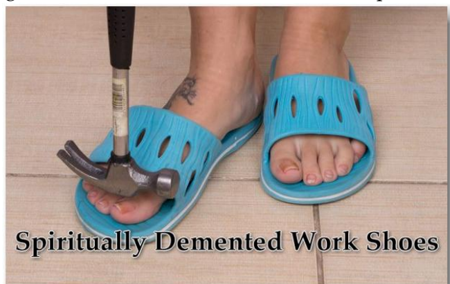
Spiritually Demented Work Shoes

WHY DO WE REJECT THE STATUS OF SLAVE, AND PREFER THE MORE POLITICALLY CORRECT LABEL OF SERVANT?