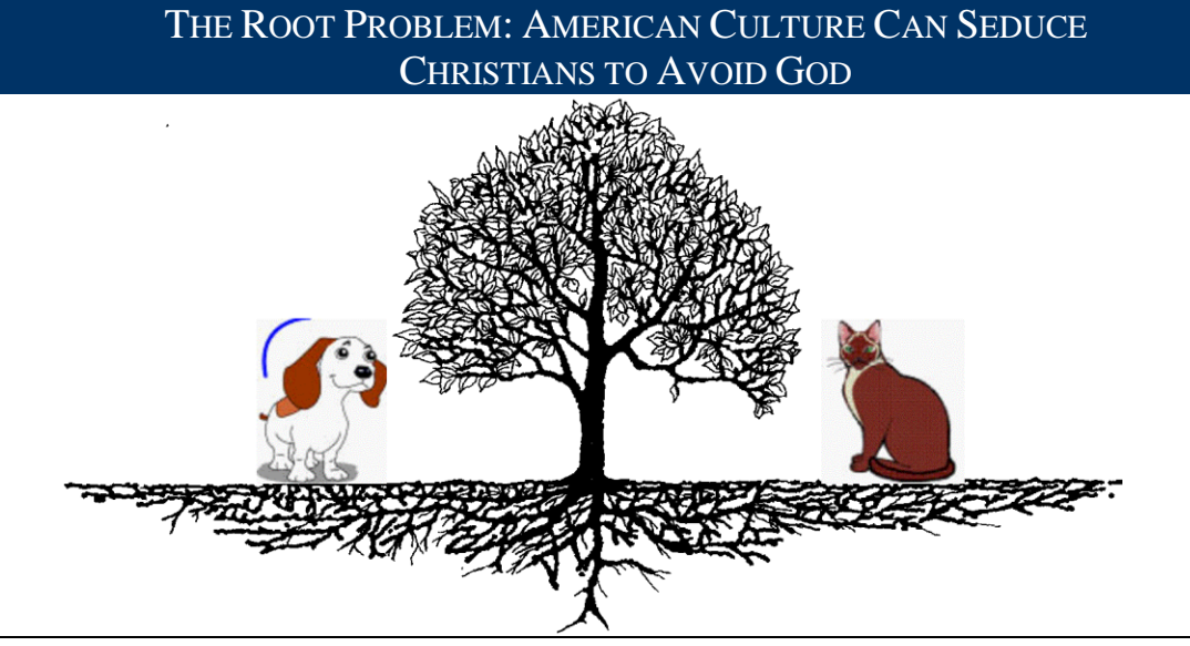
How being "American" in name and culture hinders and helps the Godly citizen ...